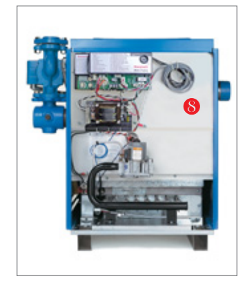
Typical MG 100 E PS interior with Electronic Ignition.

A durable and attractive panel protects controls and wiring.